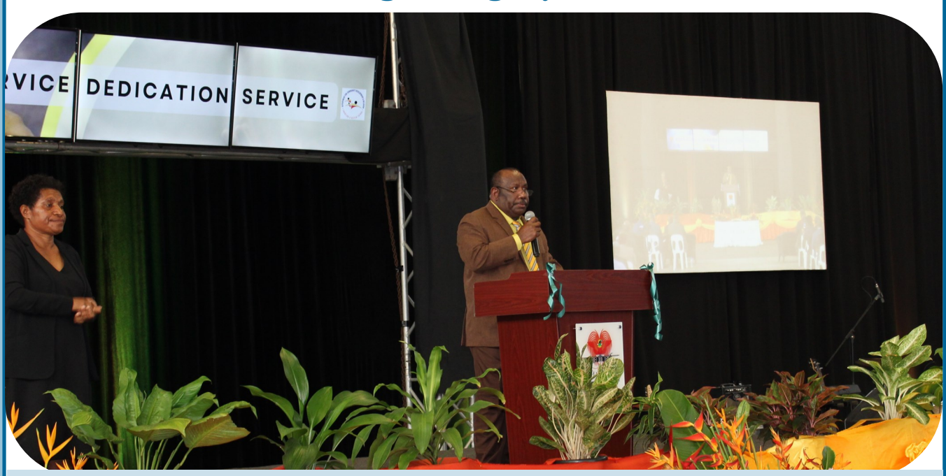
Public Service Minister, Hon. Joe Sungi delivering his welcome remarks during the Public Service Dedication service.

Joe Sungi when delivering his repeated absenteeism and the lists service to become smarter, leaner welcome remarks Public Service Dedication Service and good report of performing public by removing duplication and reminded all public servants to serve servants and change the negativity to inefficiencies that will provide the with Integrity and Skillfulness.