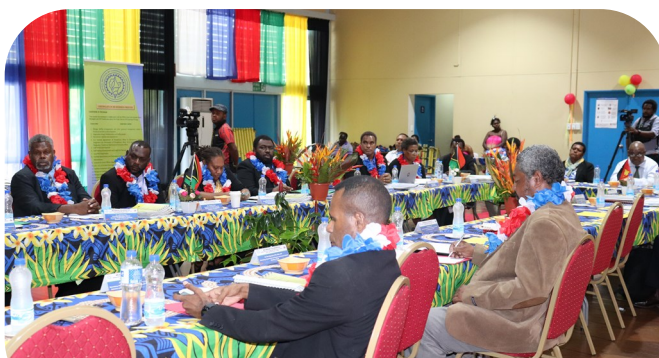
The Vanuatu Delegation, PILAG and Heads of some Government Agencies during the welcome meet at PILAG early this month.

Therefore, the VIPAM delegation was here to provide representatives that will be reviewing and proving critique on two new courses, observe first-hand and critique the online delivery platform that will be used to offer these trainings meanwhile visiting relevant agencies of PNG government to discuss matters of mutual interest and finally to strengthen the bilateral partnership that exists between PILAG and VIPAM.