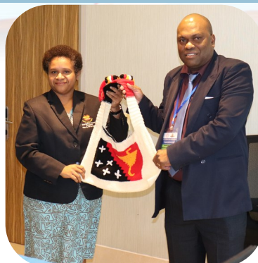
Presentation of Bilum gift on behalf of DPM to Vanuatu PSC Secretary.