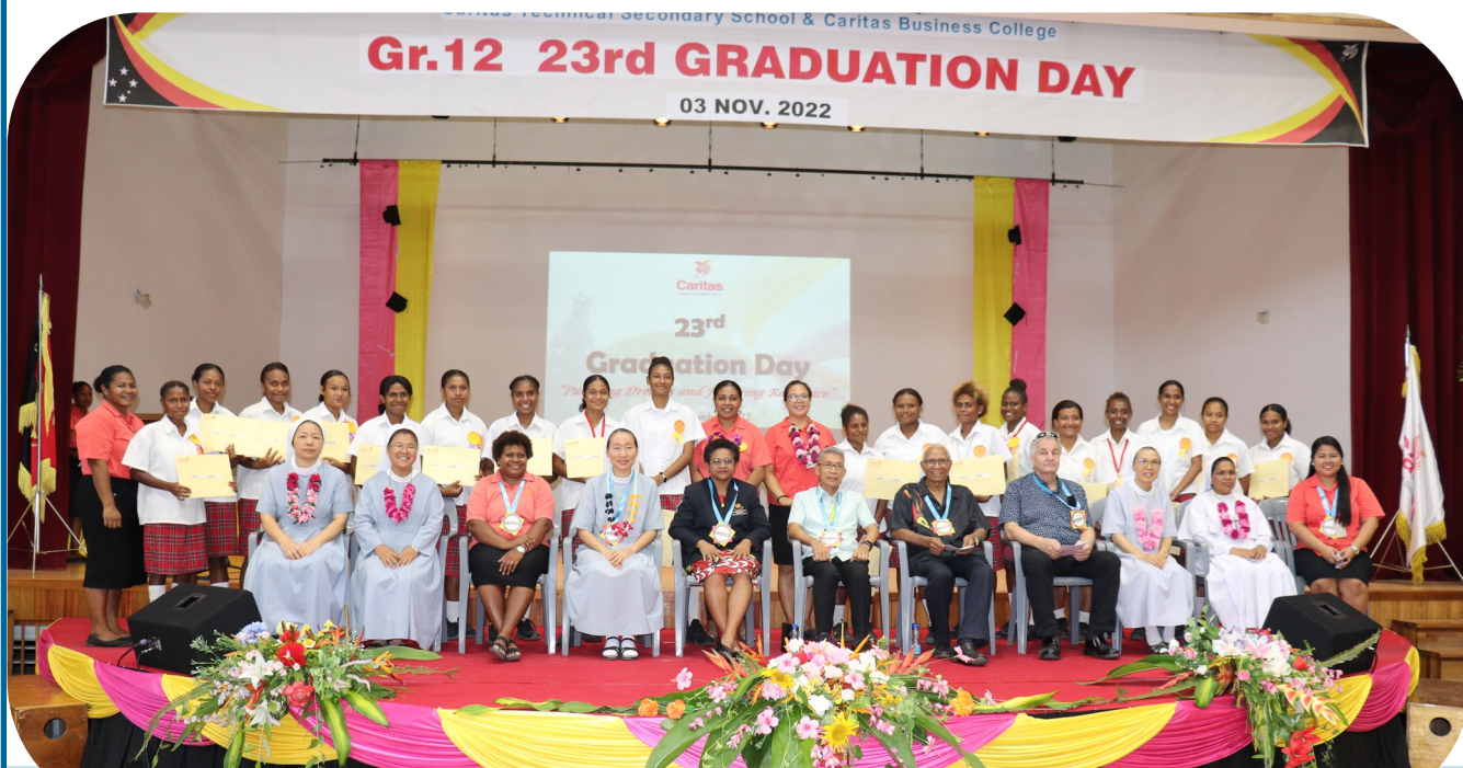
The top performing students posing for a photo shoot with the school board, administration and the invited guests.