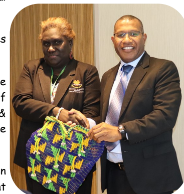
Presentation of Bilum gift on behalf of DPM to one of the Vanuatu delegations.