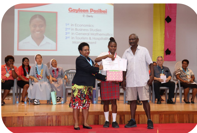
Presentation of prizes to the top performing students.

It will be mandatory that those who choose to become career public servants will undergo training courses at the Pacific Institute of Leadership and Governance (PILAG) to instil knowledge, value, skills, and the right kind of attitude the government anticipated.