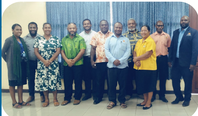
Members of the Male Advocacy Network.

Members of the Public Service Male Advocacy Network have met during one of their monthly meetings this month to discuss the designing of a Public Service Man logo that will represent the network.