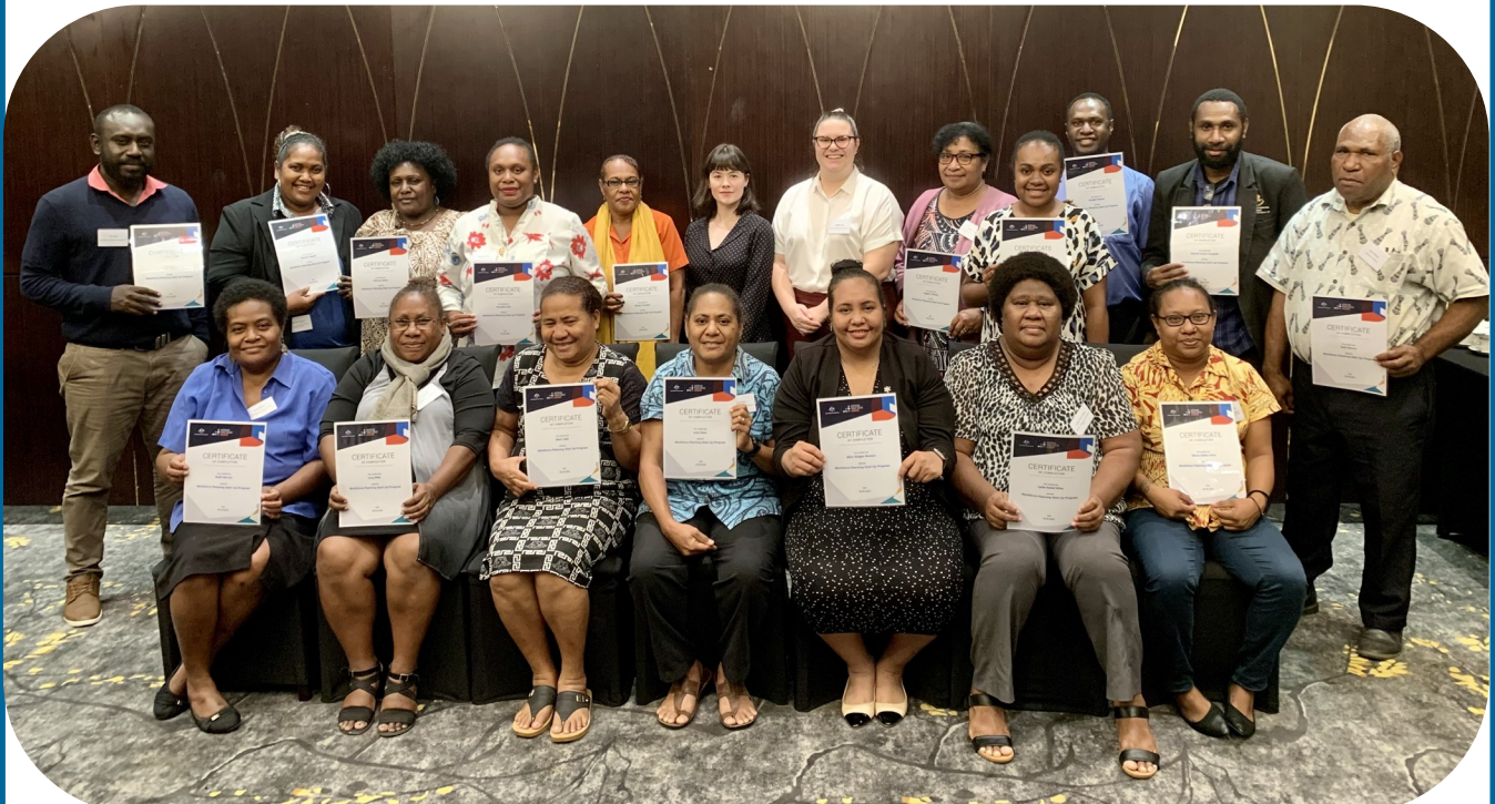
All of the participants who attended the Australian Public Service Commission.

DPM have five officers who participated and have received the Certificate of Attainment.